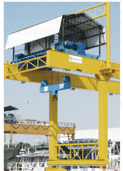
Perfect balance Synchronized hoist drives keep platforms riding in the shaft in a level position.

Joint solutions. – Proper operation within a mere \pm 5^\circ of tilt is ensured by NORD frequency inverters that feature field-oriented control technology, which provides for constant speeds under changing loads and very high torques during start-up. This solution comprising two-stage helical bevel geared motors and frequency inverters is only the latest in a series of collaborative projects undertaken by NORD and ElectroMech: over the course of several years, the two partners have implemented a substantial number of applicationspecific drive solutions for various hoist systems.