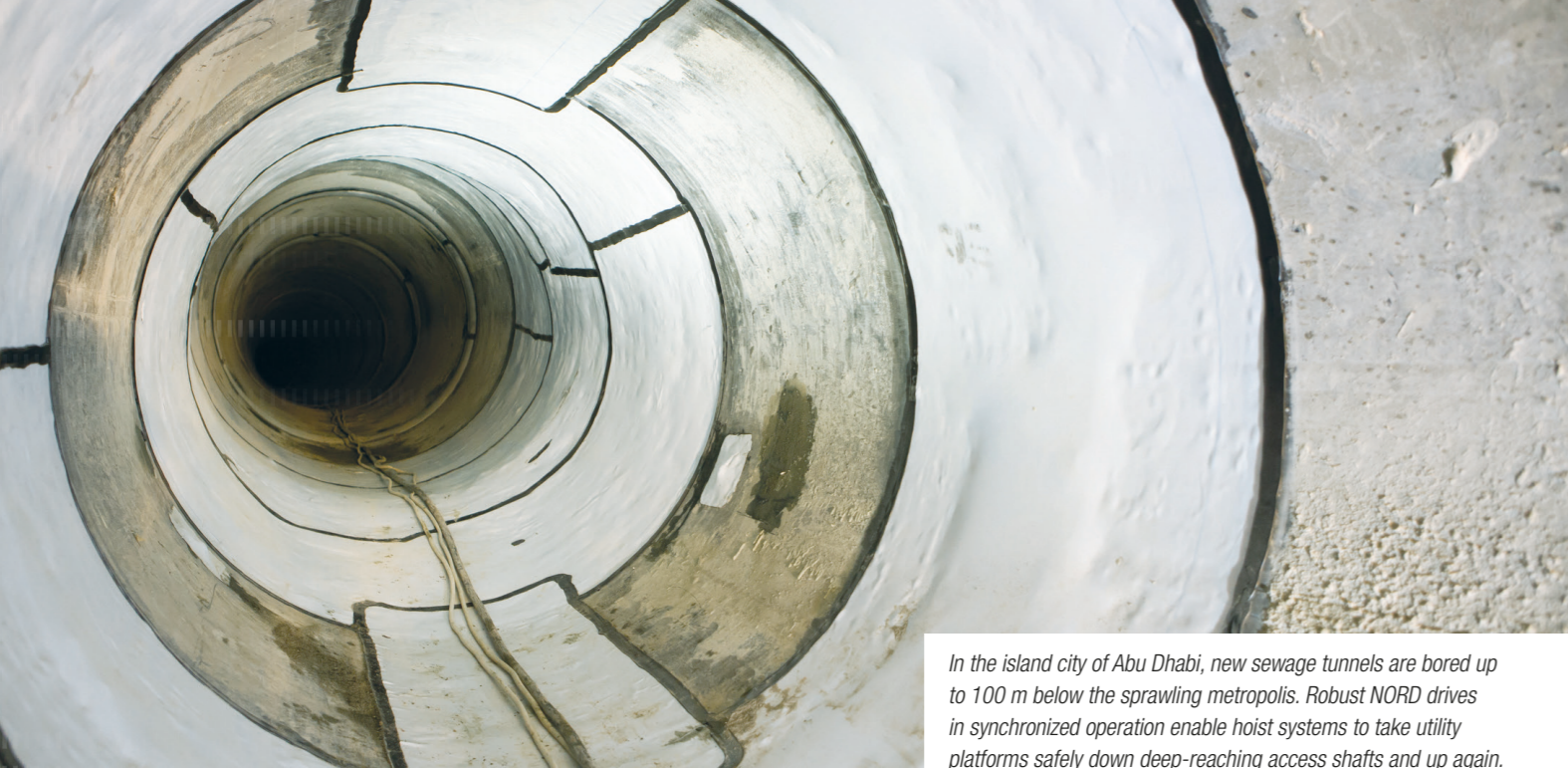
In the island city of Abu Dhabi, new sewage tunnels are bored up to 100 m below the sprawling metropolis. Robust NORD drives in synchronized operation enable hoist systems to take utility platforms safely down deep-reaching access shafts and up again.